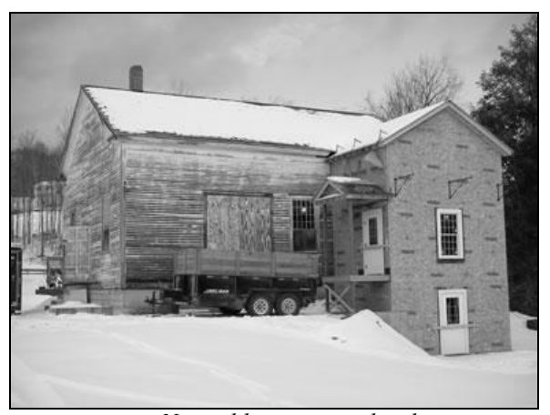
New addition on south side.

year's project will have to wait for warmer weather.