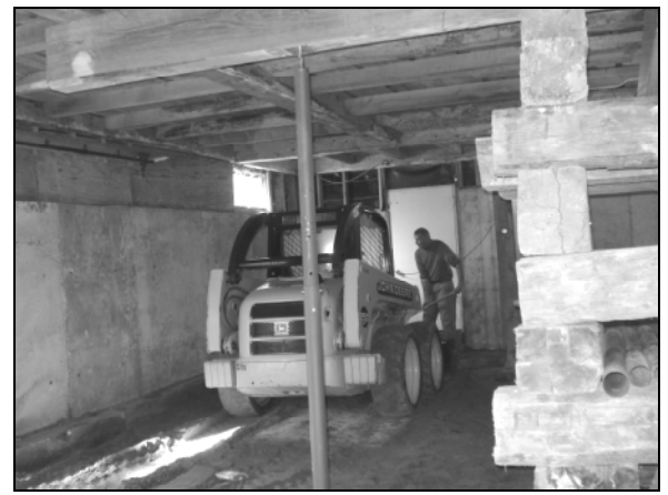
Basement floor excavated, hall floor leveled, steel beams added for support