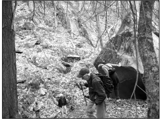
16 hikers explored Honto's Cave in April