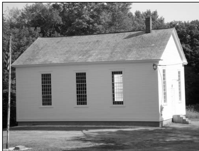
The North Chittenden Grange Hall with its new coat of paint.

assisted by a Preservation Grant, made possible by a partnership between the Freeman Foundation and the Preservation Trust of Vermont.